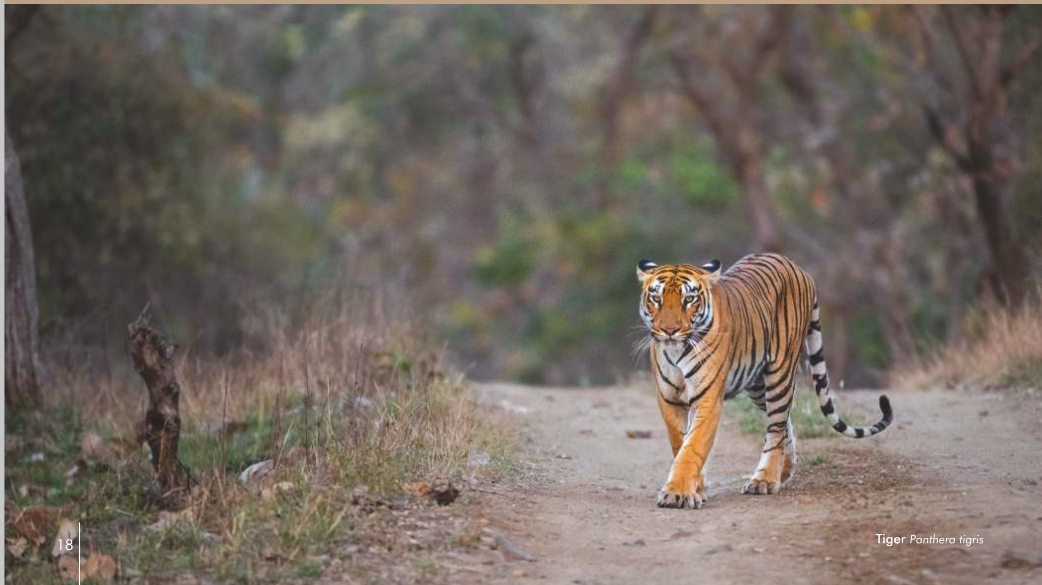
Tiger Panthera tigris

Bor Wildlife Sanctuary, New Bor Wildlife Sanctuary, New Bor Extended Wildlife Sanctuary