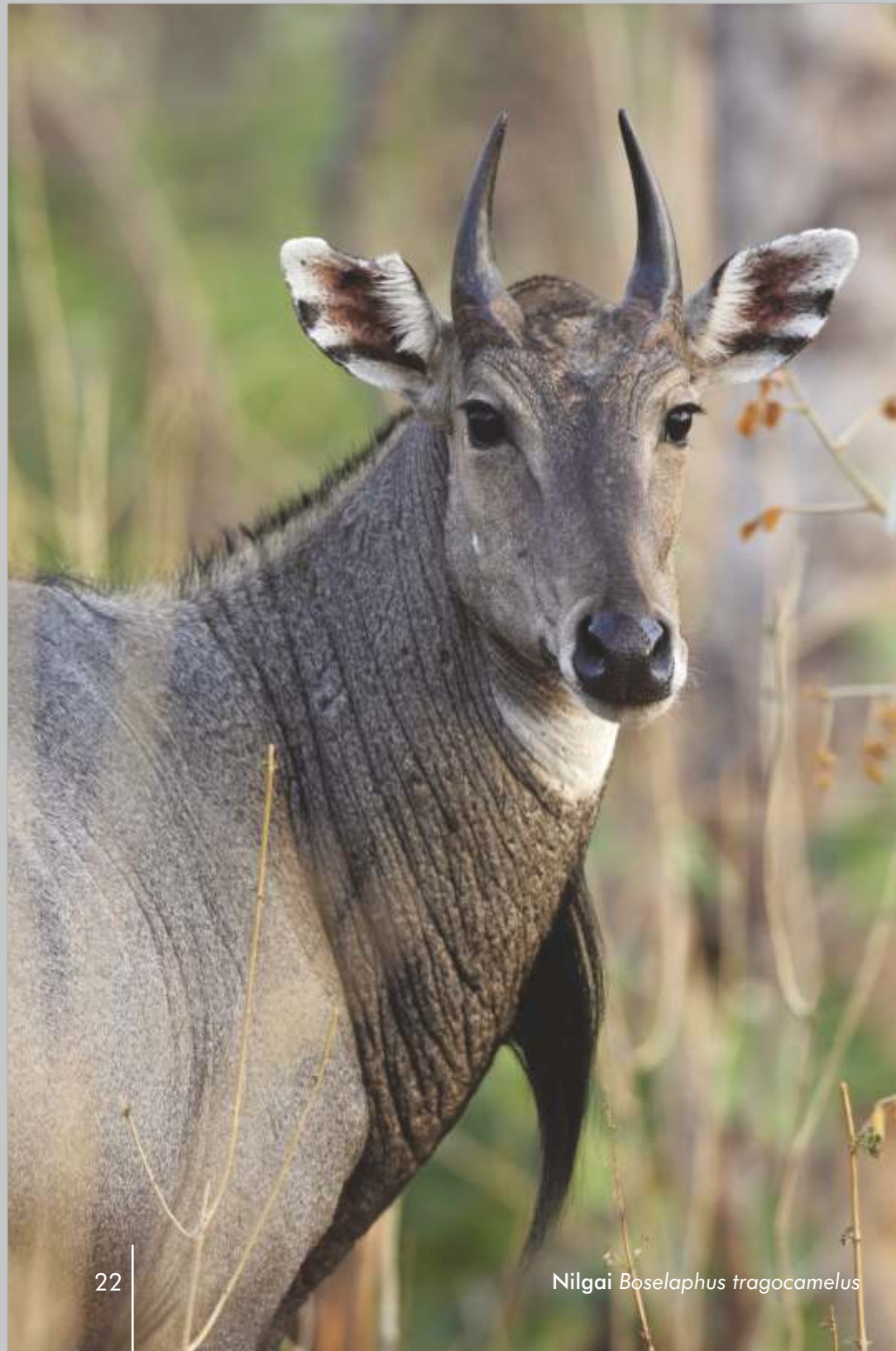
Nilgai Boselaphus tragocamelus