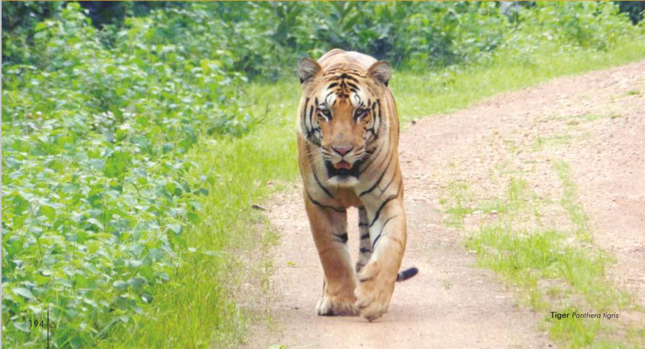
Tiger Panthera tigris

Umred Karhandla Wildlife Sanctuary, about 58 kms from Nagpur, is spread over Pauni, Umred, Kuhi and Bhivapur taluka. This Sanctuary has also connection route Tadoba-Andhari Tiger Reserve through forest along Wainganga river. The Sanctuary is home to resident breeding Tigers, herds of Gaurs, Wild Dogs and also rare animals like Flying Squirrel, Pangolin and Honey Badger. It is bounded roughly by the Wainganga river and the Gosikhurd dam on the west and a narrow 10 km long range of 600-800 m hills to the northwest. It is located 40 km north of Tadoba-Andhari Tiger Reserve 60 km from Nagpur. Umred-Karhandla was declared as a Wildlife Sanctuary on 29/06/2012, having an area of 189.30 sq.km. As per tiger census of 2014 there are 4 adults and nearly 9 sub adults or cubs in this area. Efforts to notify the protected area as a tiger reserve are in progress.