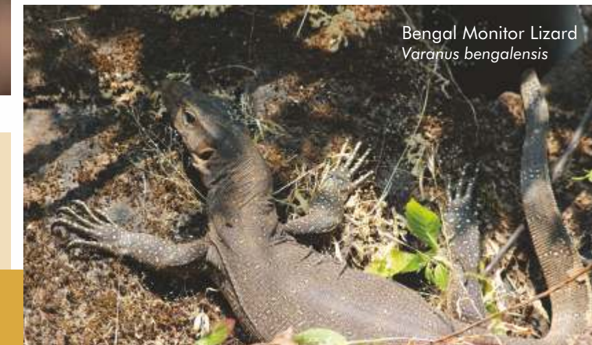
Bengal Monitor Lizard Varanus bengalensis