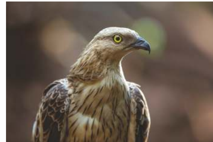
Oriental Honey-buzzard Pernis ptilorhynchus

How to reach By Air : Nearest airport Nagpur 100 km. By Rail : Nearest railway station Nagpur 100 km. By Road : Umred Bus station 53 km.