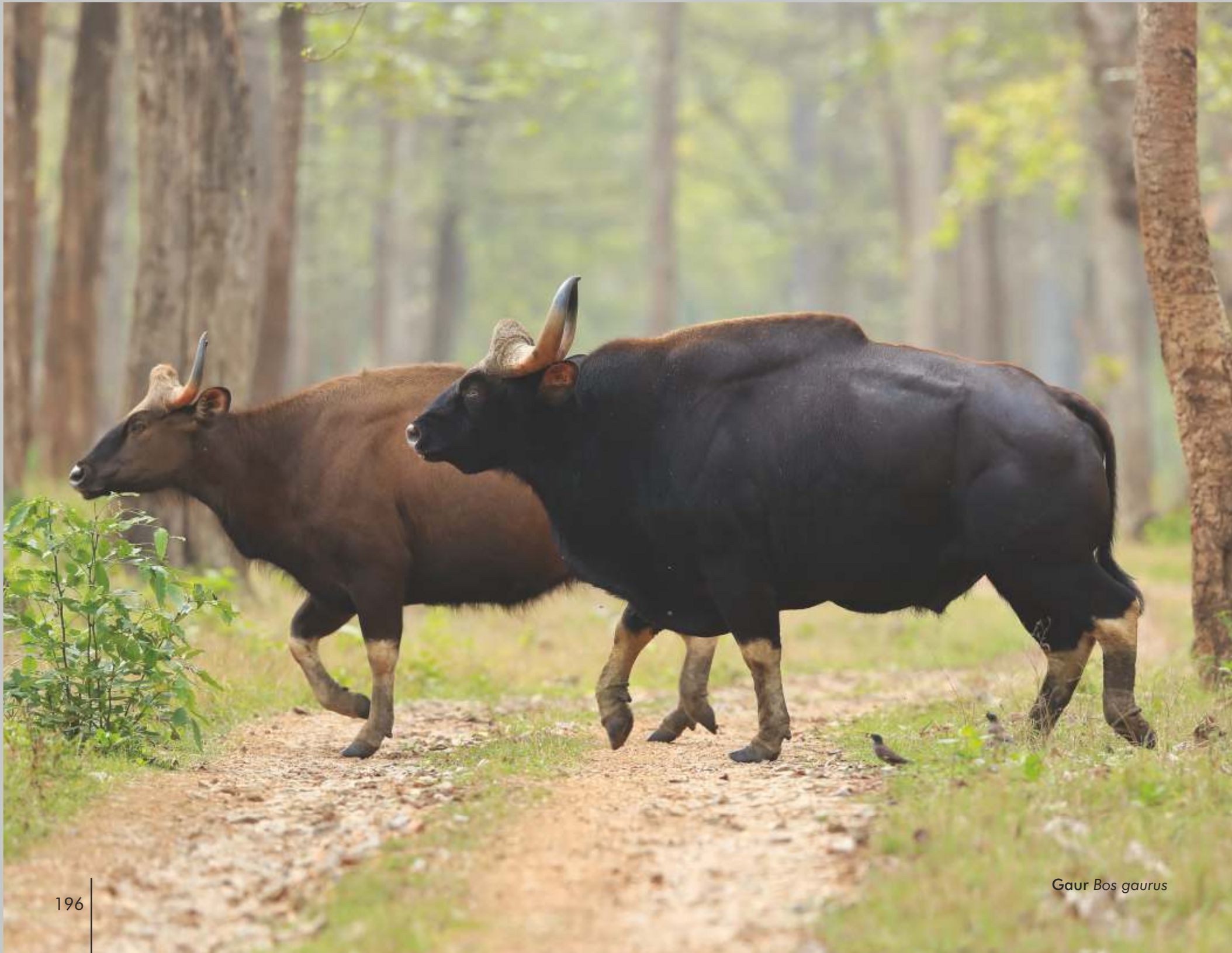
Gaur Bos gaurus